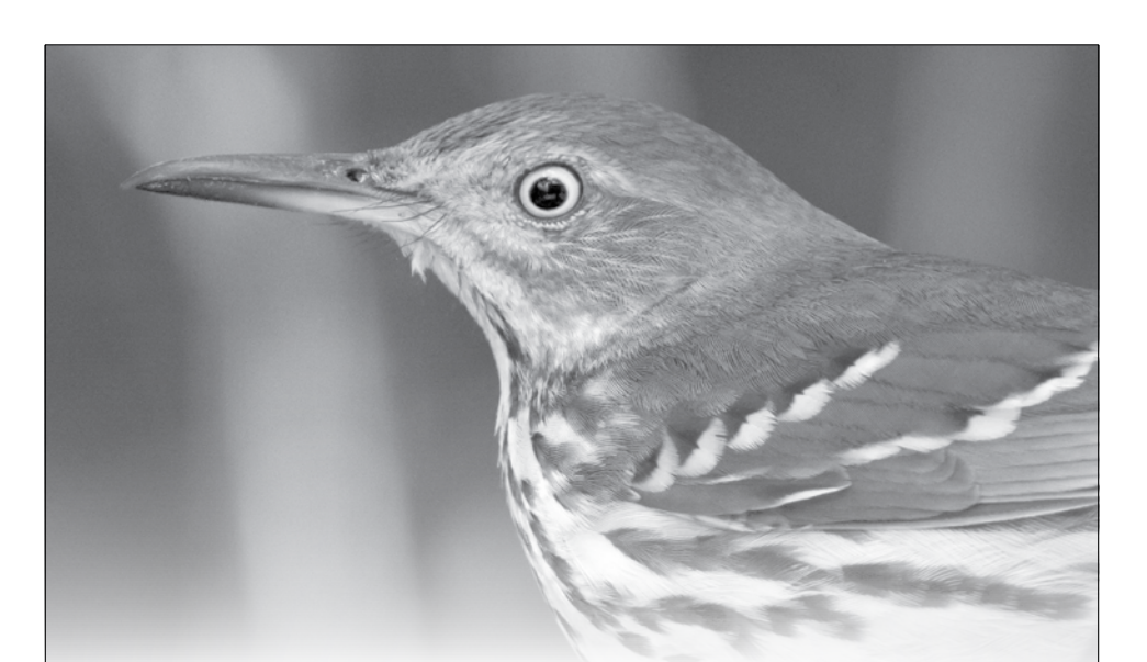
Figure 1: Brown thrasher trends for the United States, Christmas 1939–1961.